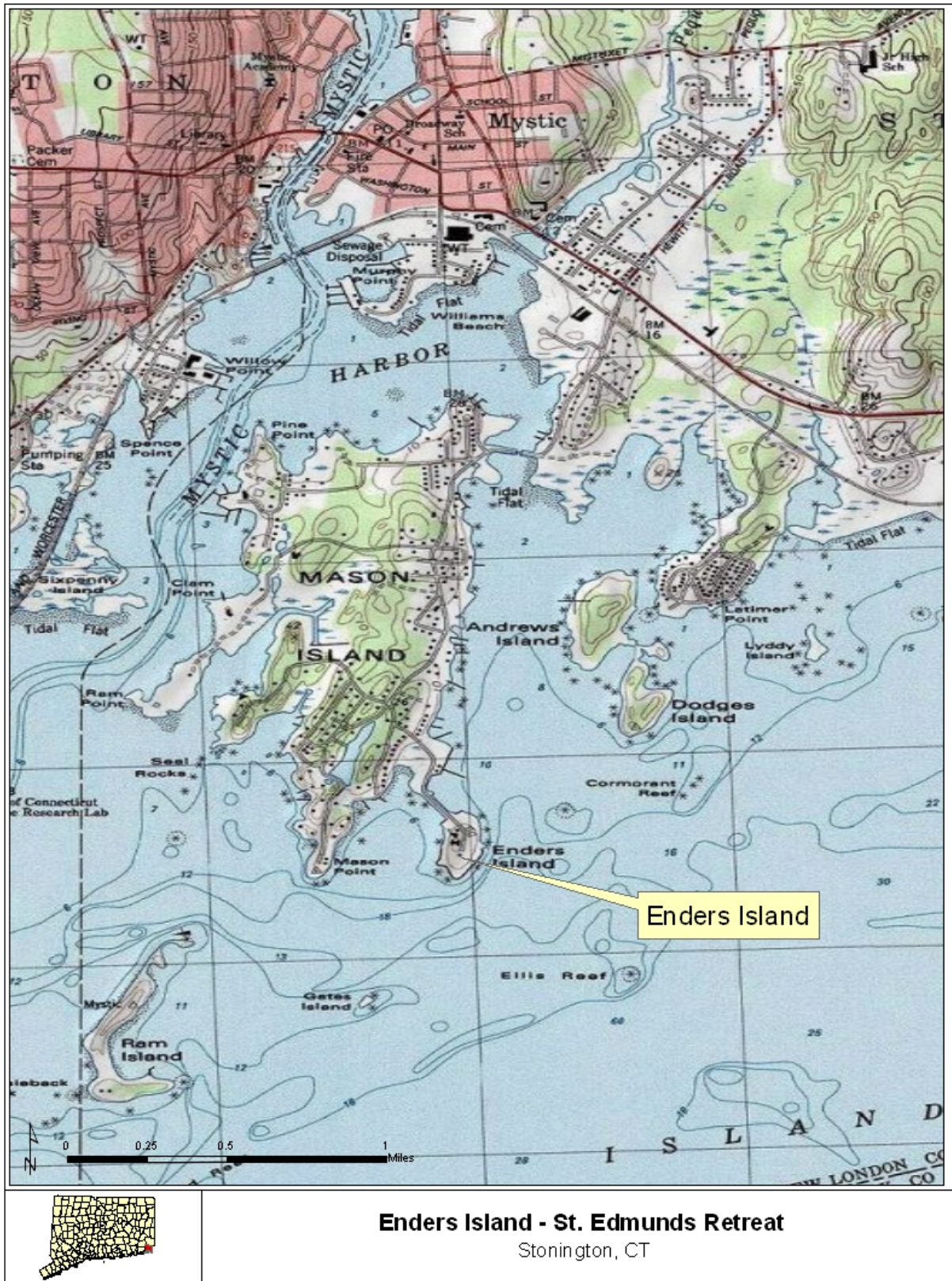
Figure 1. Project Location